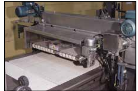
Dual Band Slicer