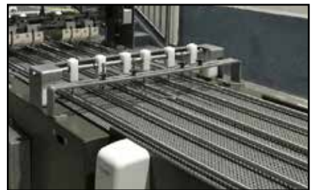
Adjustable Lane Guide System