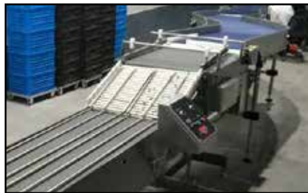
Accumulation Conveyor and Slide