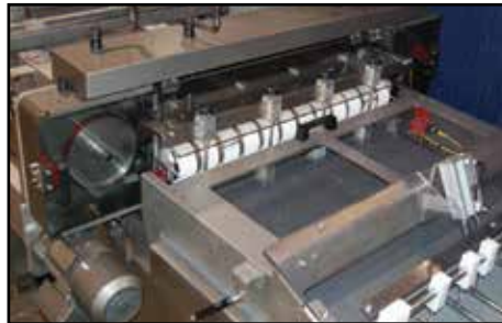
Single Band Slicer

Designed for easy product changeover including quick change lane adjustment and a variety of slicing and sealing options.