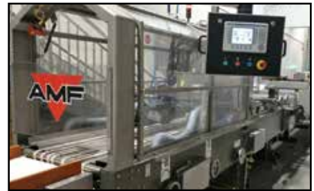
Hot Air Side Cut and Seal System