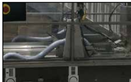
Hot Air Side Seal System