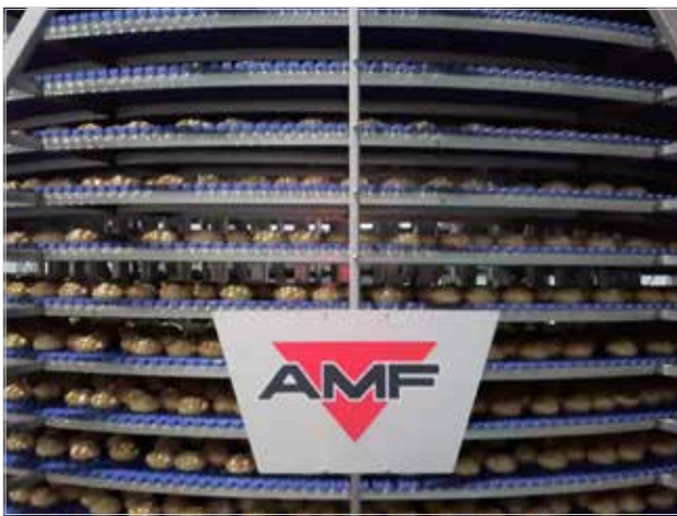
Improved Sanitation and Maintenance Access

APEX Spiral Coolers are the best value engineering, suitable for conveying a variety of product types and product applications. Designed with high operating efficiency at minimum power requirements, cooling options provide optimal product control and orientation. APEX Custom-configured Spiral Conveyors ensure reliable product cooling and transfer to AMF's efficient packaging technology.