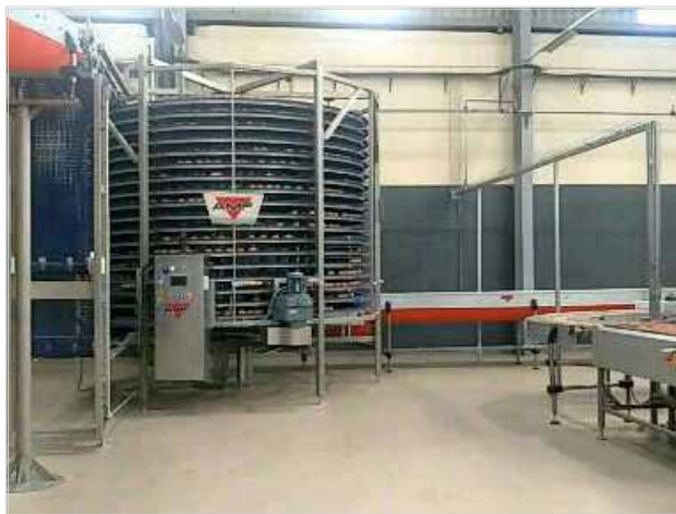
Eliminates Product Movement On Belt